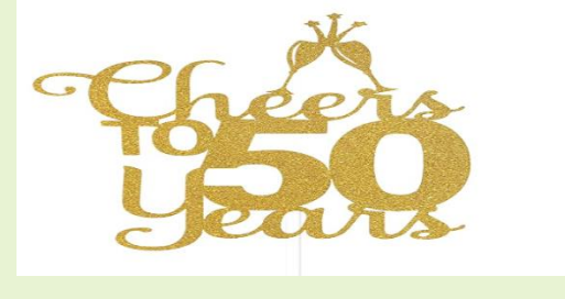
50th Wedding Anniversary

We're very resourceful us kiwis - it always amazes me how we can band together and create a superb meal as we did, with plenty left over for seconds. Many thanks and congratulations also to Gail and Bill for the delicious golden dessert in honour of their